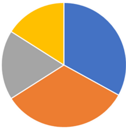
Students' Reading Habit

■ Rarely/ Never Reading Books ■ More In Paper ■ More In Digital ■ Both